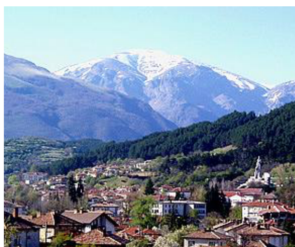
View from my hometown Kalofer.