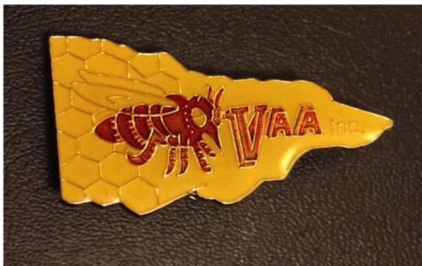
Victorian Apiarists Association (VAA) badge.