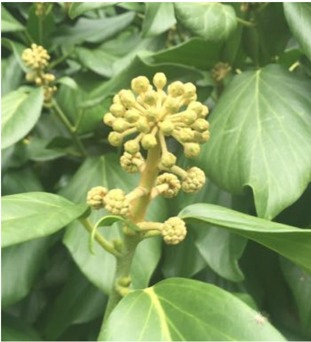
Ivy flowers almost ready to open.