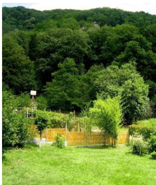
View of my friend's apiary – we became beekeepers together many years ago.