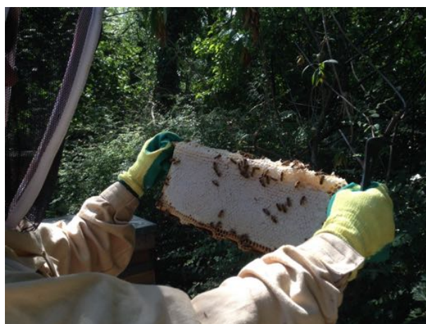
Emma inspecting a super frame.