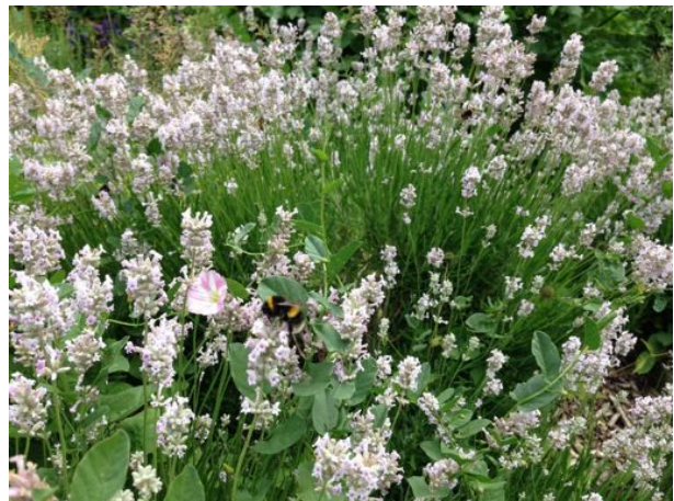
Bumblebee on pink flower

Above you can see the bees busy on the tops of the super frames. At this time of year inspecting is a difficult business as there are just so many damn bees. Around 50-60,000 of them. Everywhere you try to put your hands on a frame, a bee pops up. I have been finding that inspecting without gloves amongst this mass of bees concentrates the mind wonderfully. I am actually getting stung less ? because I move my fingers very slowly and carefully to secure a hold amongst the bees. Before I would get stung by accidentally squashing them, but this hasn't happened now for weeks. The catch is very sticky, mucky hands which are harder to eat cake with afterwards!