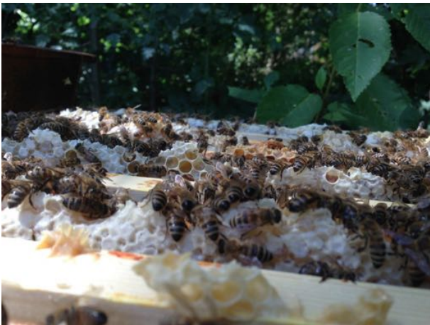
Bees on top of super