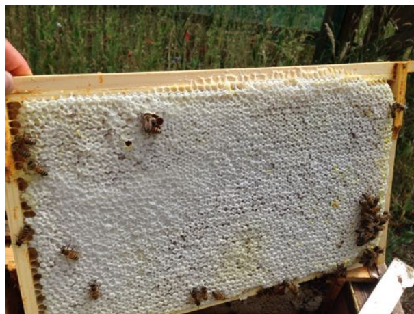
Brood frame containing honey.