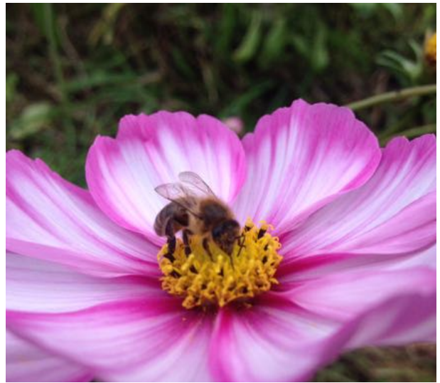
Honey bee visits a Cosmos flower.