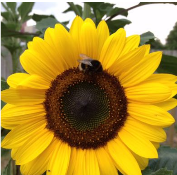
Sunflowers offer copious amounts of nectar on warm days.