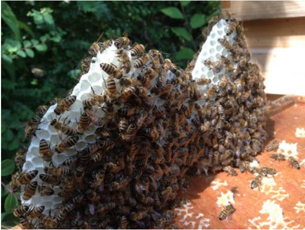
Bees on natural comb