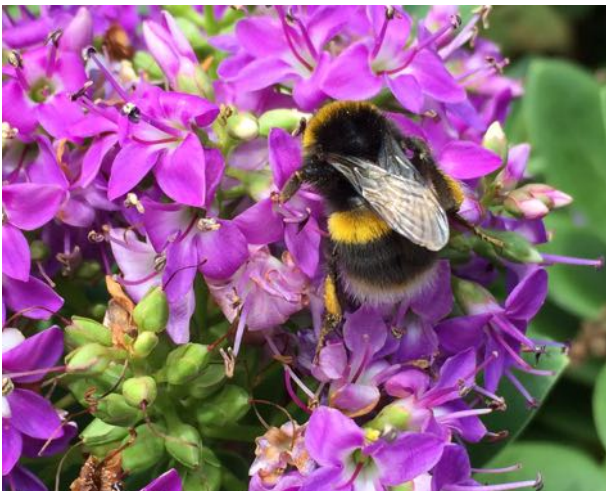
Hebe great ornamental flowers July to September.