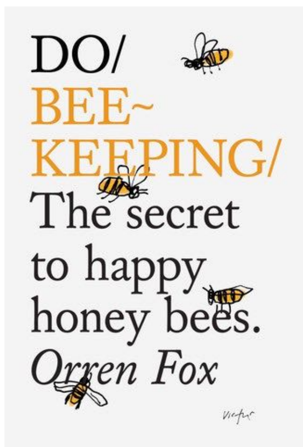
The 'Secret to happy Honey Bees' cover