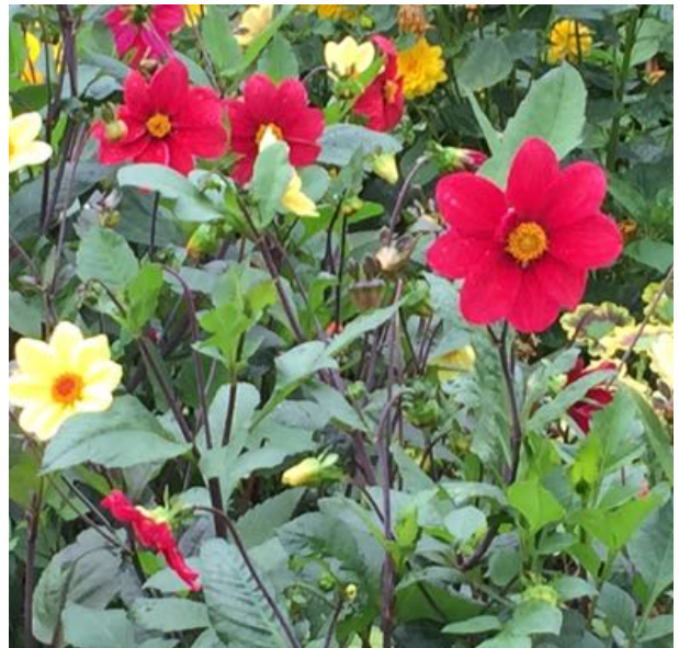
Dahlias provide bright yellow/orange pollen.

Most of our native flowers are now long since over flowering but a few persist. Asters, Field Scabious, Purple Loosestrife, Water Mint, Mallows and Purple Hoarhound continue to flower. On disturbed ground and brownfield sites yellow toadflax and willow herbs and bindweed are also persisting.