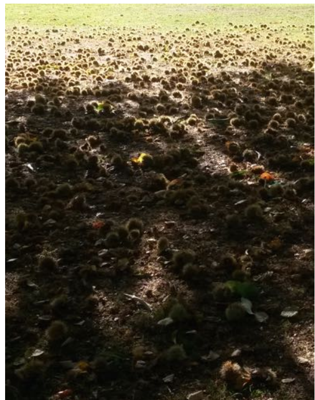
A sunny Autumn day, under a chestnut tree in Hyde Park.

LBKA's big news for this past year is of course that we are now registered as a Charity. On most day-to-day levels there will be no discernible difference. The