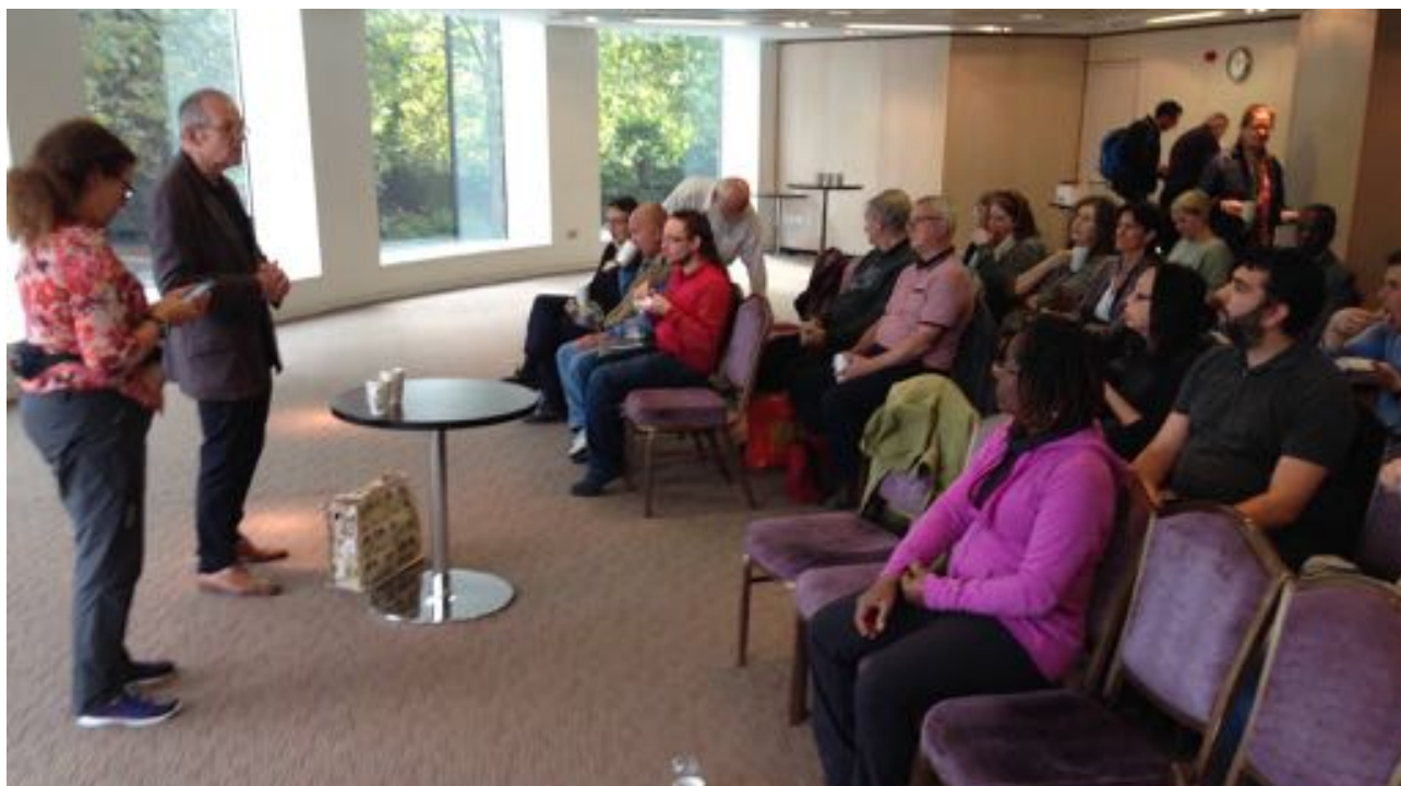
Last month's Monthly Meeting.