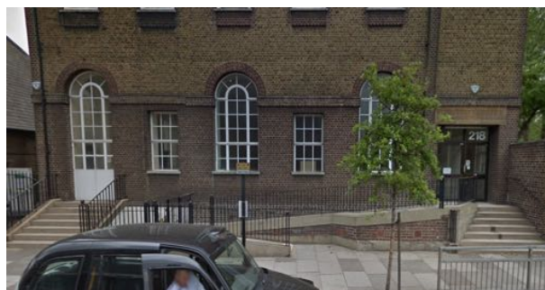
The venue for November's monthly meeting – the white door on the left.

The whole committee and LBKA trustees will be up for election. Nominations for all committee positions closed a couple of weeks ago and you'll have seen these