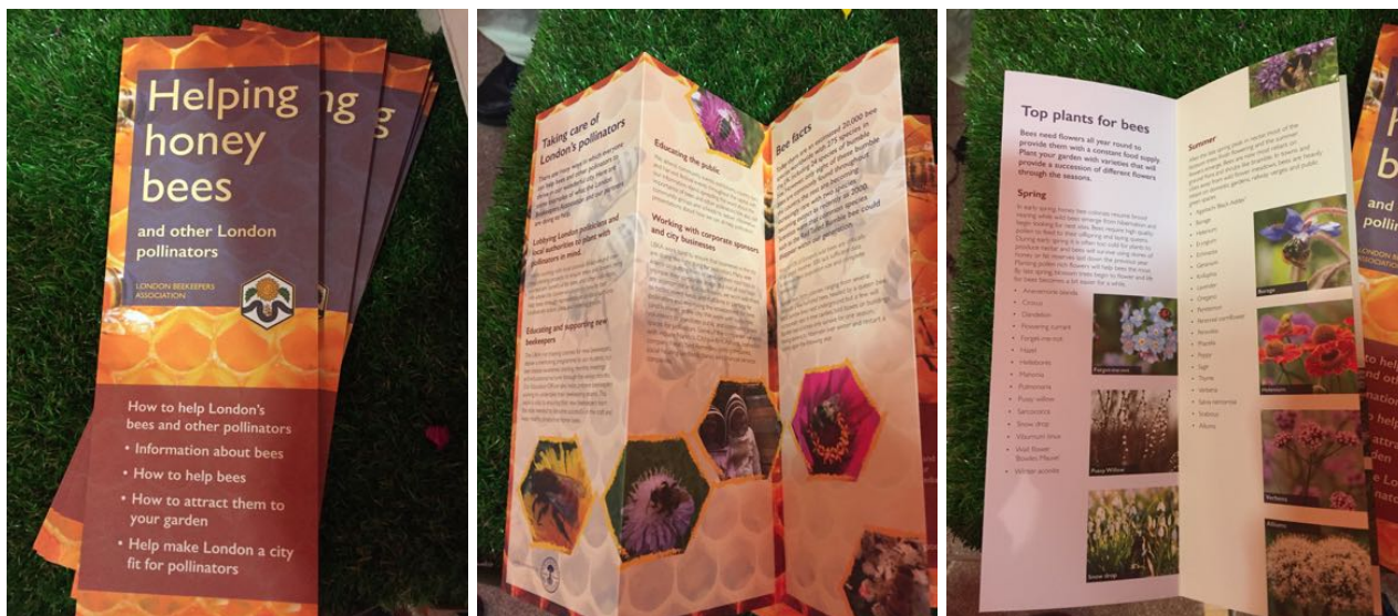
Our new glossy and informative leaflets.

hold onto our more experienced members and maybe lure a few back.