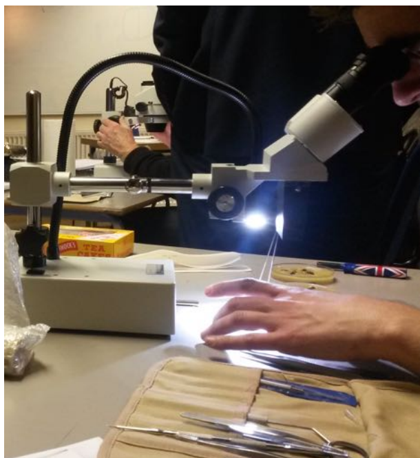
Microscopy from a couple of years ago.

as a couple of housebricks on the roof is usually sufficient for a National with a well fitting flat roof. They are designed not to blow off. A hive with a gabled roof, such as a WBC, may need tethering with rope.