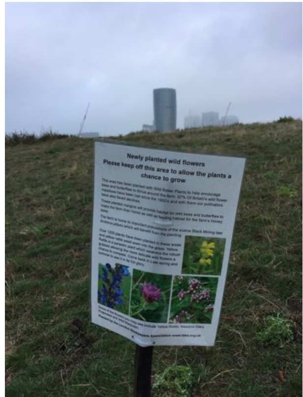
Keep off the newly planted areas!

Please register your interest by email to education@lbka.org.uk as soon as possible. This does not require you to commit at this stage but, if oversubscribed, we have to allocate places on a first come / first served basis. The last 2 years the event was oversubscribed within 24 hours of the newsletter being emailed to members.