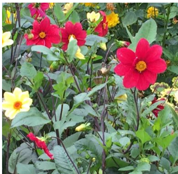
Dahlias provide bright yellow/orange pollen.

ering but a few persist. Asters, Field Scabious, Purple Loosestrife, Water Mint, Mallows and Purple Hoarhound continue to flower. On disturbed ground and brownfield sites yellow toadflax and willow herbs and bindweed are also persisting.