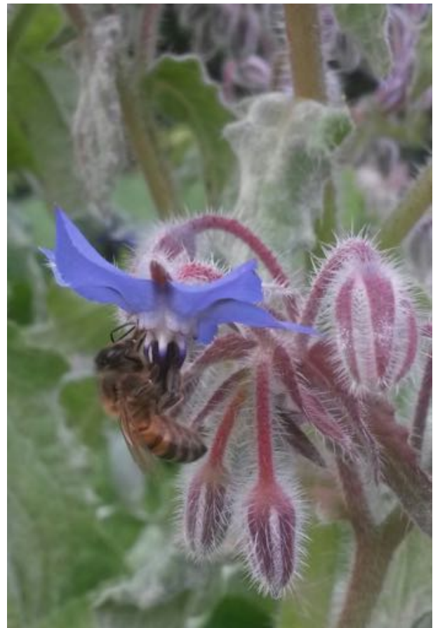
Honey bee on borage.

Our organisation has been growing and changing since I first joined nearly 9 years ago but our change to charitable status seems to have coincided with and helped