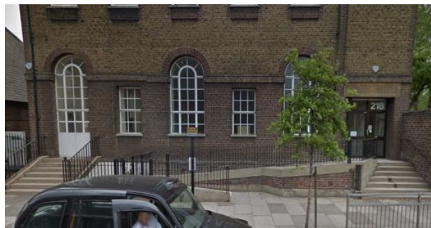
The venue for our monthly meeting – the white door on the left.

Our monthly meeting will be on Sunday 10th September at 11:00 on the subject of preparing bees for the Winter . We're back at our usual venue of Fairley House Junior School, 220 Lambeth Rd, London SE1 7JY .