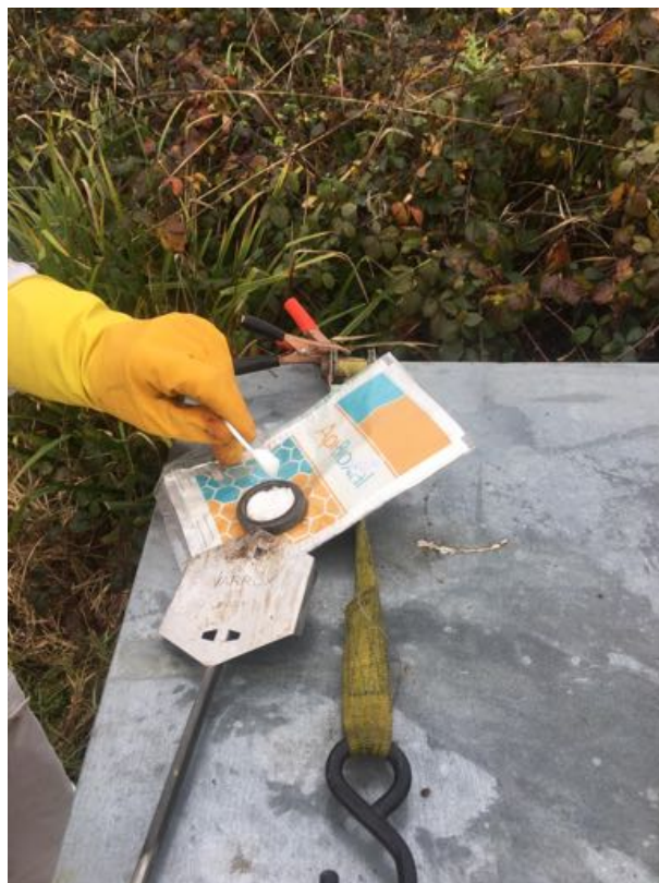
Geoff measuring out the ApiBioxal (approved oxalic acid treatment) crystals in the sublimator. This is heated by passing an electric current through from a car battery.