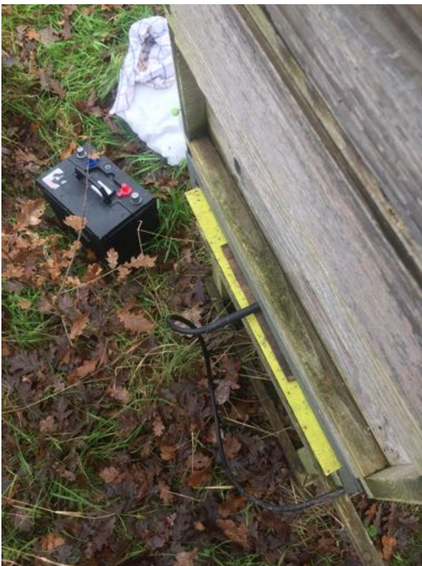
Sublimation in action.

suitable. It should not be possible to smell through the filter.