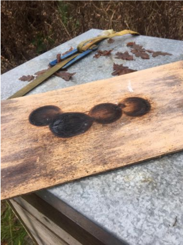
The sublimator gets hot!