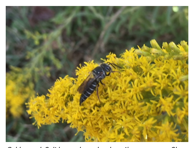
Golden rod Solidago, the only plant I've ever seen Sharp Tailed Bees frequent

can potentially also excavate lateral burrows entering through the many perforated holes in the metal sheet. Try using soft and sharp sand, cactus compost or John Innes loam based soil with added sand. You can plant drought-tolerant flowering plants in the top too to provide cover as some bees prefer some vegetation cover near their nests whilst others prefer a more open aspect.