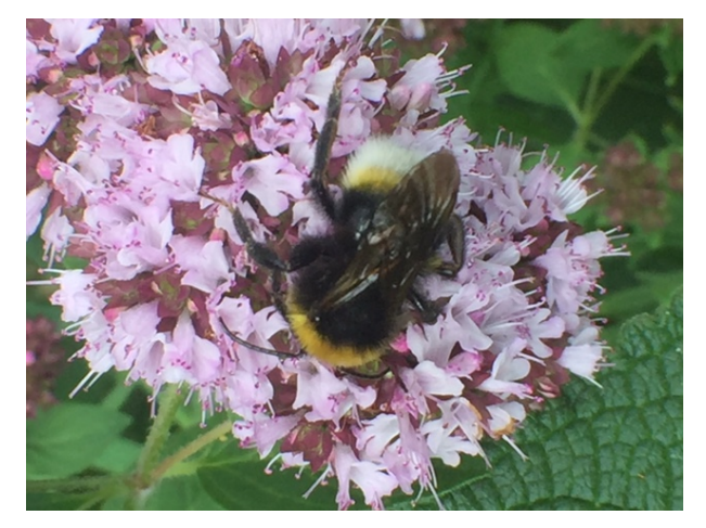
Knapweed, one of the highest yielding nectar plants. Its cultivated cousin Montana is equally as good and has a very long flowering period lasting all spring through to autumn.

water feature into your garden where bees can gather water