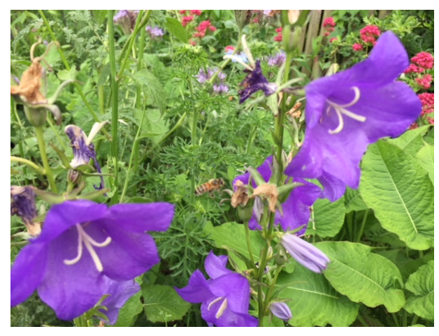
Oregano, the best butterfly plant. The awesome beeattracting plant also supports other common and scarce species