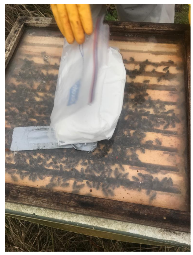
Feeding bees fondant. The bees are not clustered (as seen through the Perspex crown board).

Battersea. Please let Tristram (apiaries@lbka.org.uk) have your order.