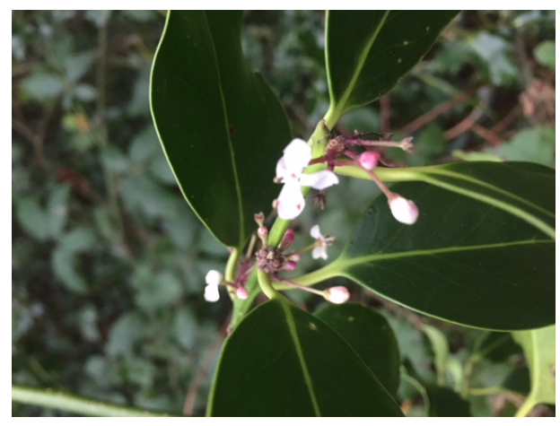
Holly, the Male plants are coming into flower now and will continue through spring when the separate female trees also bloom

bles do also flower and the fruits we eat need the bees to pollinate them.