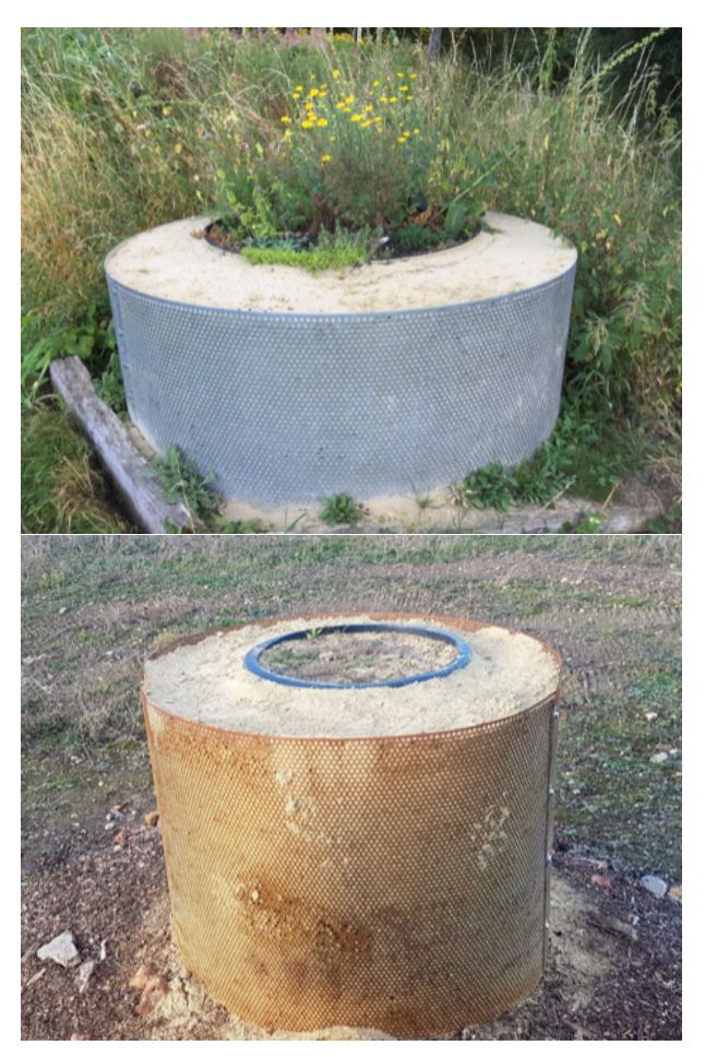
Solitary bee nest planters.

Bulking up your gardens by planting the most attractive and beneficial plants for a broad range of insects will provide the most benefit to pollinators, whilst adding plants which are attractive or of benefit to only a small number of species helps provide food for more fussy specialists – often the species most at risk. There are many bees which are not generalist and will only feed their offspring pollen from a small number or a single species of plant. Plant a mixture of broadly attractive and specialist plants and choose plants which will offer flowers over a long season or plan a succession of flower types throughout the season. See the tables on pages 12 and 13. There are lots more planting suggestions on my plants for pollinators pages along with download