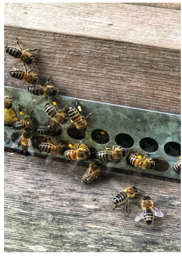
Spotted by Sara: Planning a Pollen Party for New Year's Eve? Photo and caption: Sara Ward.

But the outcome is not limited to what goes on in the box. The hive functions not in isolation but in a wider, dynamic environment. London's heat island effect micro-climate, combining with climate change and