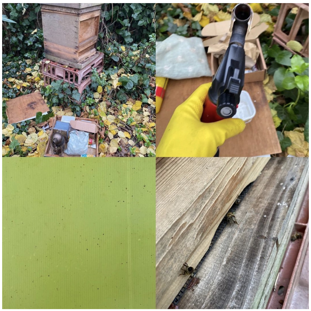
Thanks to Lucie for her pictures of varroa treatment of the Adelaide community garden's hive last Thursday. Some bees were actually bringing pollen in, and quite a few mites dropped onto the tray despite the treatment taking less than a minute. Photo and caption: Lucie Chaumeton.