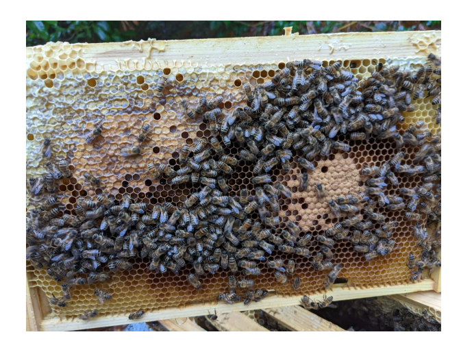
Spotted by Stephen: Very quick inspection on 27th December showed brood in all stages, including a section of capped brood. There was no brood or eggs at all on 28th November. This confirms that the best time to do an oxalic acid treatment this year was late November or three first week in December. Treating during the week between Christmas and New year's Day will not be as effective Photo and caption: Stephen Wheelwright.

will persist, and that the future is inherently uncertain. Contingency planning and flexibility will be required.