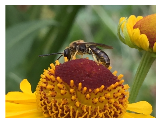
Bellflower, the sole pollen source for Bell Flower Scissor Bee and Harebell Blunthorn Bee