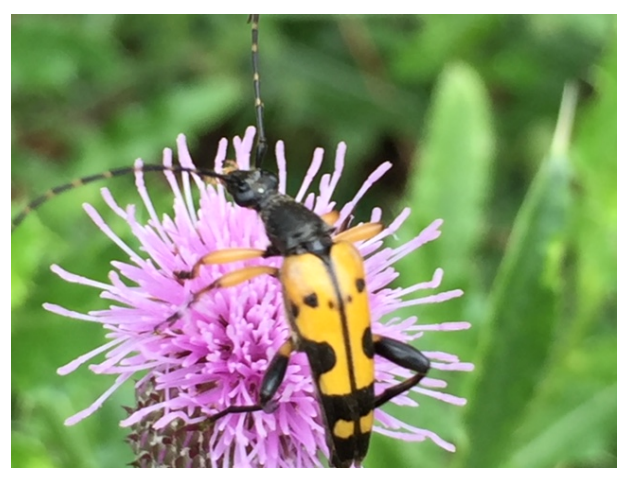
Cirsium (thistles) are the highest yielding UK native nectar plants and super-important bee forage. Here one is being visited by a male longhorn beetle Retpela maculata.

Other ideas you could try include making a nesting cylinder for ground nesting bees. You need to invest in a sheet of perforated metal sheeting which you bring together at the ends and fasten together with nuts and bolts to form a cylinder. This is then filled with sand or free draining soil to provide a medium which bees can burrow into. This design allows bees to nest in the top of the planter by burrowing downwards but they