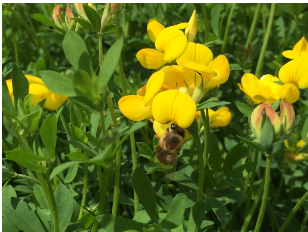
Bird's Foot Trefoil

Lime honey is highly sought after as it has a minty aftertaste and tangy tone to it. It's also high in fructose sugars and low in glucose meaning it stays liquid for a long time and resists crystallisation prolonging its shelf life and makes an attractive looking jar of honey for the sales stall.